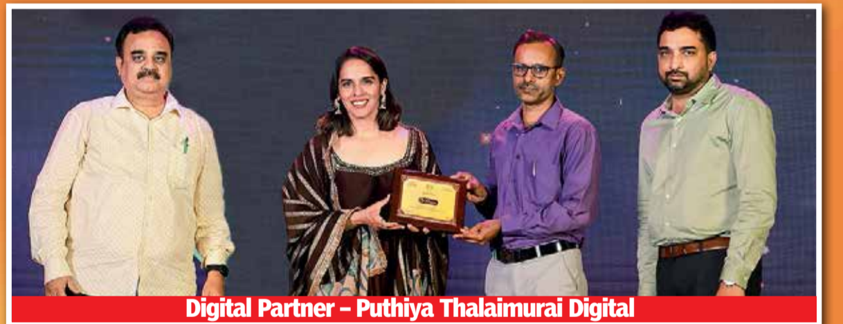
Digital Partner - Puthiya Thalaimurai Digital