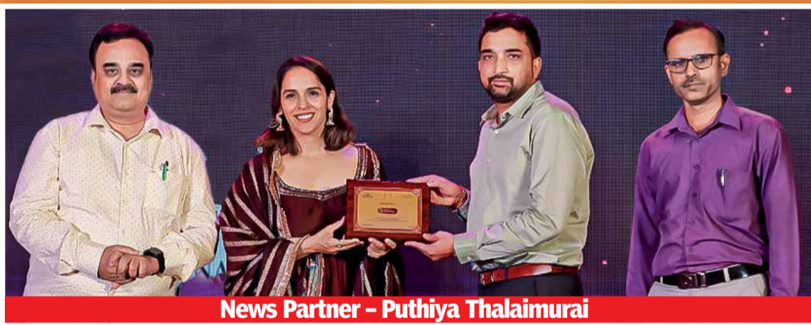
News Partner - Puthiya Thalaimurai