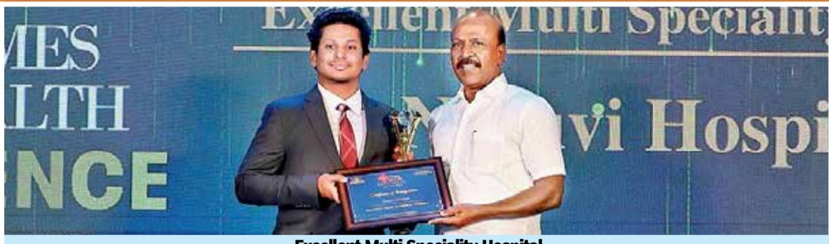
Excellent Multi Speciality Hospital Naruvi Hospital Nithin Sampath