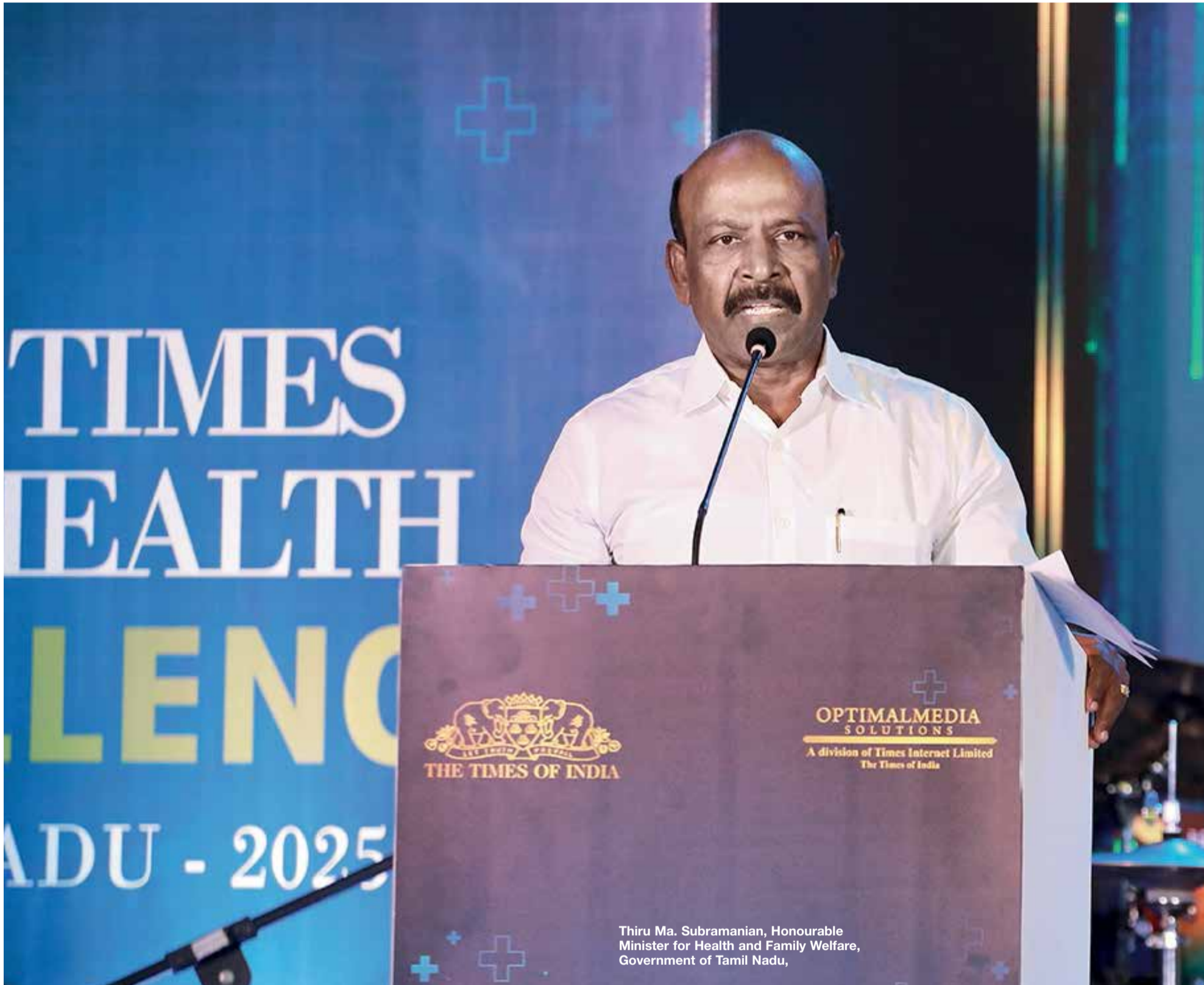
Thiru Ma. Subramanian, Honourable Minister for Health and Family Welfare, Government of Tamil Nadu,

Here's to the champions of healthcare—pioneering advancements, saving lives, and shaping a healthier future for all.