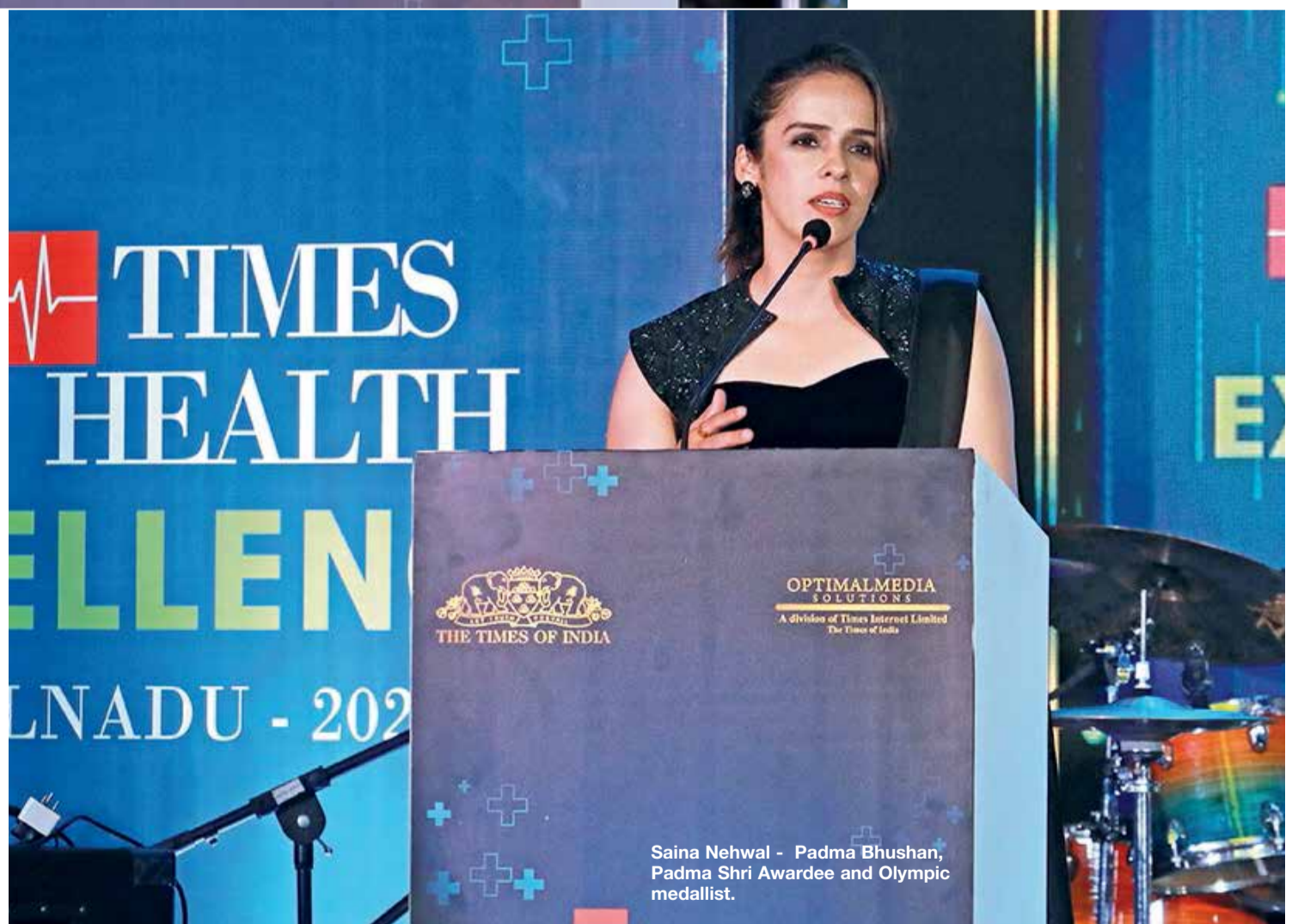
Saina Nehwal - Padma Bhushan, Padma Shri Awardee and Olympic medallist.

With cutting-edge technology and expertise in fields such as cardiology, oncology, neurology, and organ transplantation, Chennai has become a global healthcare destination. Medical tourism