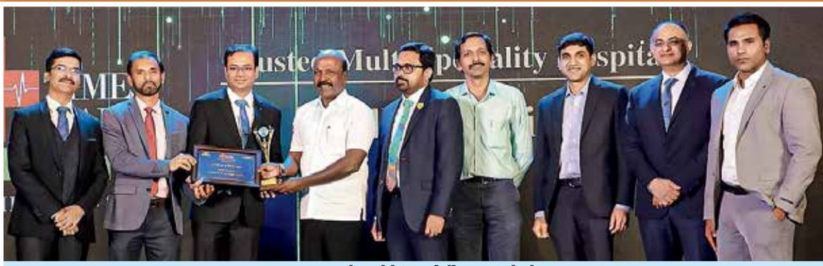
Trusted Multi Speciality Hospital Apollo Hospitals