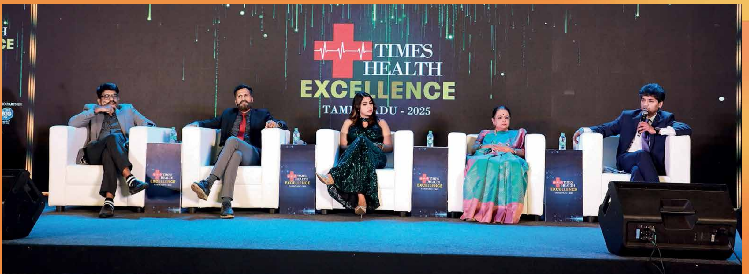
Panel Discussion : The Future of Healthcare