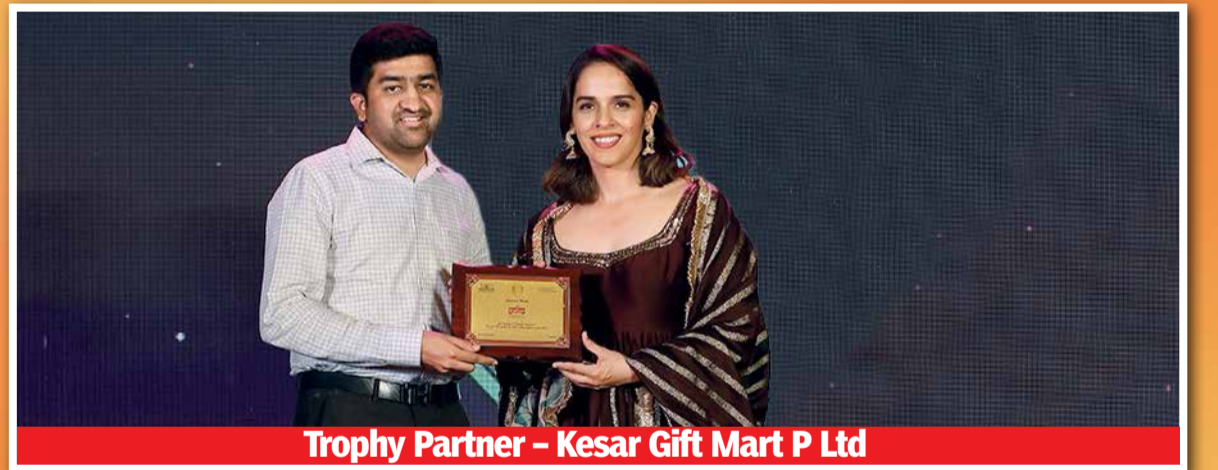
Trophy Partner - Kesar Gift Mart P Ltd