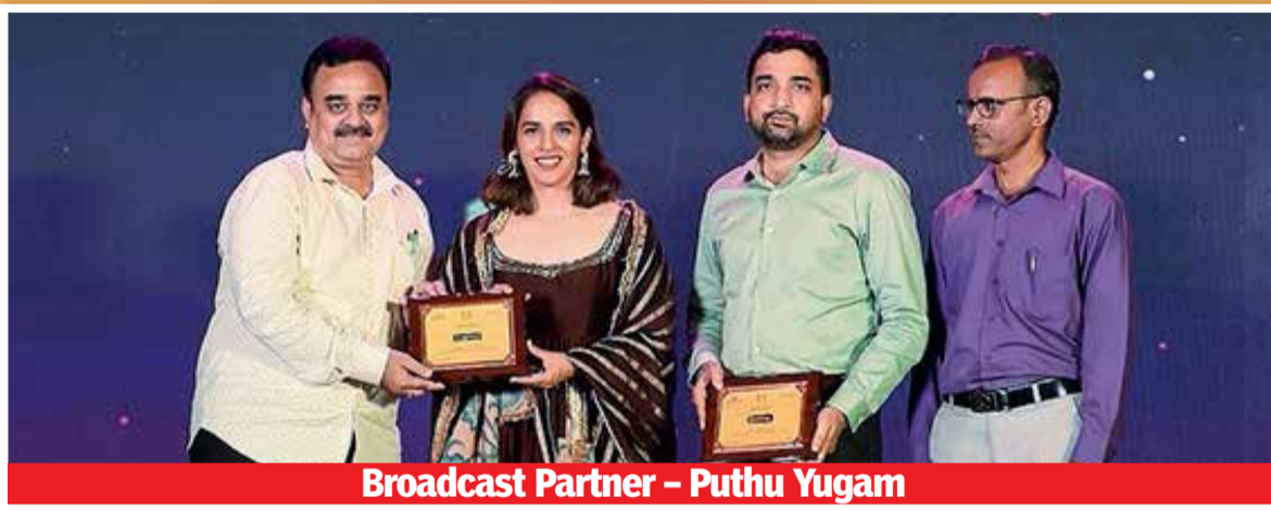
Broadcast Partner - Puthu Yugam